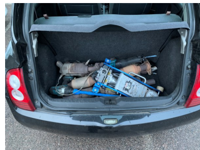
Left: Findings from the A13 stop on 30th November

We are aware of concerns in relation to dogs being stolen, however it has become apparent that conversations being had may not reflect current recorded crimes. At the beginning of February, officers stopped a van in Loughton linked to reports of suspicious behaviour across the district. After speaking with the driver and searching the van, officers were content there was no cause for concern and no criminal offence had been committed. Please keep reporting to help us respond. Essex Police has a Dog Watch scheme encouraging dog owners and walkers to be extra eyes and ears within the community. For more information and/or to join, please email: essex.watch.liason.officers@essex.police.uk .