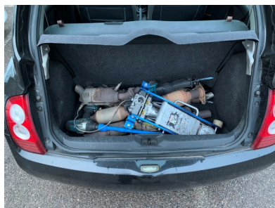
Below: Findings from the A13 stop on 30th November